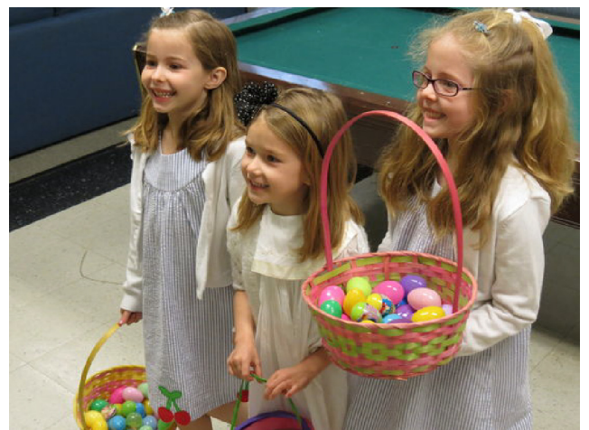
Easter Sunday, April 20, lilies and an Easter egg hunt